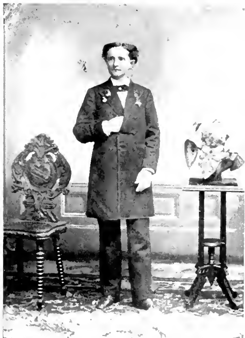
MARY E. WALKER.